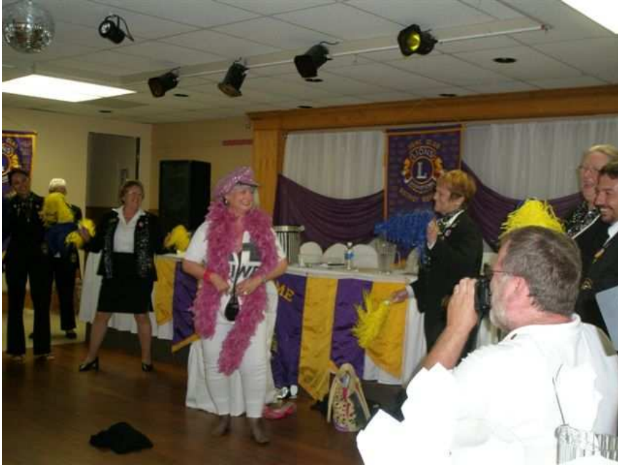
Heeeeeres Yourrrrrrrrrrrr DG!!!!