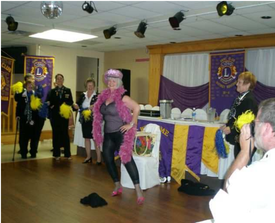
After all these years, she hasn't lost a step